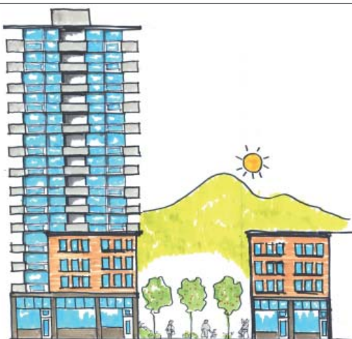
Special "Gateway" Sites Building Design: 14 storey Density: 3.8 FSR