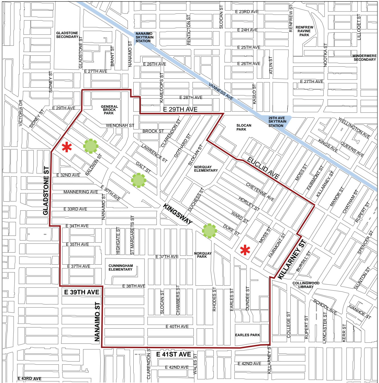
Figure 3: Mid-Block and Large Sites