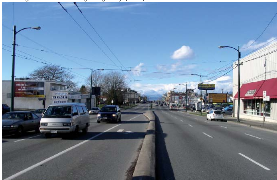
Existing conditions along Kingsway (2010)

This section outlines the basic principles, development parameters and urban design guidelines that will guide rezoning applications along the Kingsway corridor. This includes detail on the basic building typology, framework for development of key sites, urban design guidelines, and public realm improvements.