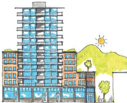
Special "Mid-Block" Sites Building Design: 12 storey Density: 3.8 FSR