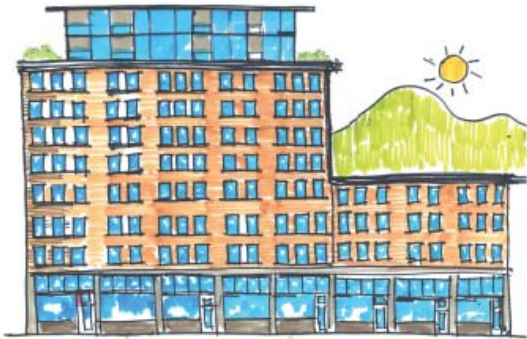
Basic Kingsway Building Design: mix of 10 storey and 4 storey Density: 3.8 FSR