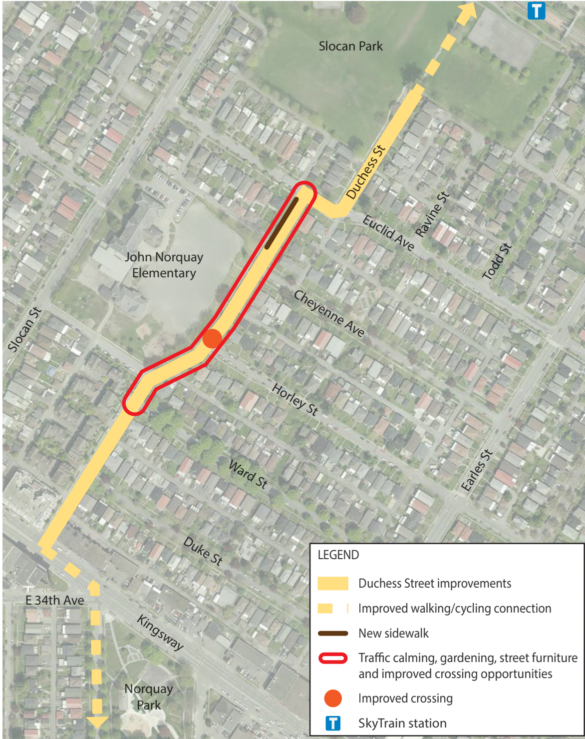
Map 4: Duchess Street Conceptual Improvements