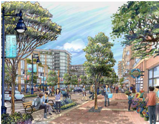
Artist's rendering of possible future Kingsway streetscape

A public realm plan can help achieve these benefits by outlining a strategic approach to how the public realm is developed and enhanced. The Norquay Village Public Realm Plan will be implemented incrementally over time, through the development process, community initiatives, strategic opportunities and partnerships, and as capital funding becomes available. This Public Realm Plan will be used by staff, applicants, and the community to guide future decisions about important aspects of the public realm.