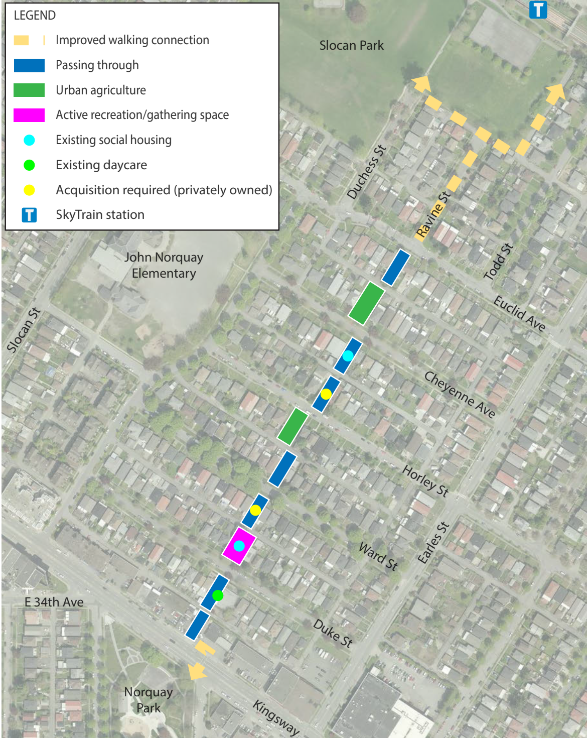
Map 3: Ravine Way Long-Term Vision