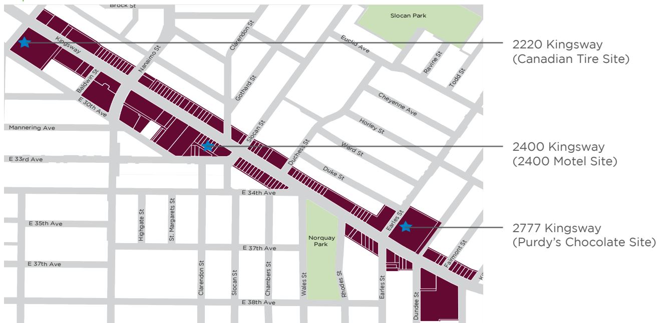
Map 2: Plaza Locations