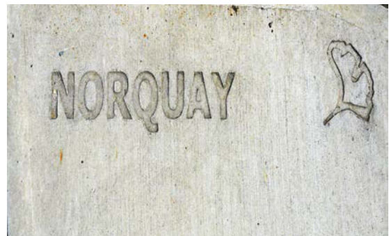
'NORQUAY' and ginkgo leaf stamps