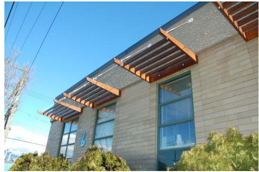
Examples of external sunshades