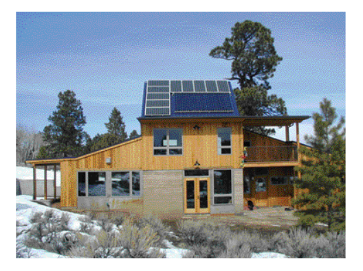
Examples of evacuated solar tube panels

Another type of solar thermal collector is the evacuated tube collector. This type has multiple evacuated glass tubes containing solar absorbers and a fluid such as water and propylene glycol which conduct heat to domestic hot water or a hydronic heating system. The vacuum within the evacuated tubes reduces conducted heat losses.