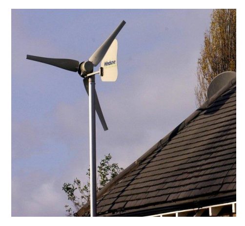
Horizontal-axis wind turbine

2.3 Wind turbines use the wind to turn a rotor, which can be used to produce electricity or do other work. Horizontal-axis wind turbines have the main rotor aligned horizontally, like a traditional windmill. Modern versions typically take the form of propellers mounted on poles. Both versions work best when they are free to swing around to face the wind. Other types contain a series of scoops within an open framework.