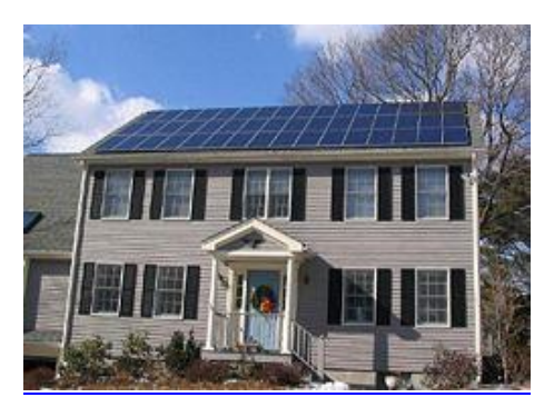
Example of roof-mounted photovoltaic modules.

2.1 Solar photovoltaic panels convert light directly into electricity. Photovoltaics (PV) are the simplest form of alternative energy. There are no moving parts in PV modules and little maintenance is required.