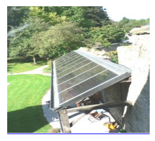
Examples of glazed flat plate collectors

2.2 Solar thermal collectors absorb solar radiation to provide heat. Glazed flat plate collectors are the most commonly used collectors for domestic applications. Generally flat-plate collectors consist of (1) a flat-plate absorber, which intercepts and absorbs the solar energy, (2) a transparent cover that allows solar energy to pass through, (3) a heat-transport fluid (air or water) flowing through tubes to remove heat from the absorber, and (4) a heat insulating backing. For storage, these systems typically use an insulated tank in or near the mechanical room.