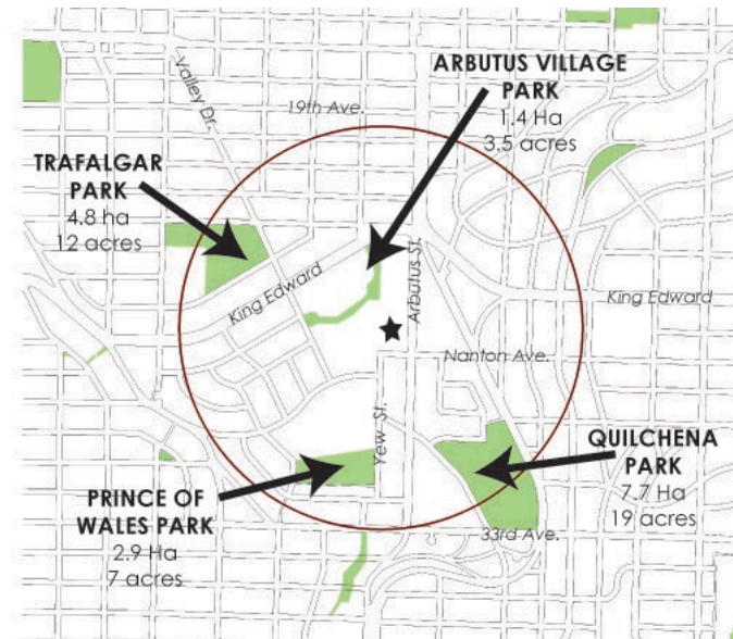
PARKS WITHIN A 0.5KM RADIUS OF ARBUTUS VILLAGE SHOPPING CENTRE SITE

Arbutus Centre does not currently have public amenities as defined by Council policy. Existing resident-only amenities on the site include a pool, meeting rooms, and other recreation facilities. As part of the overall development of Arbutus Centre in 1978, these facilities were owned by the shopping centre owners and leased to the strata corporations of Arbutus Village. The lease of this facility expires in 2013.